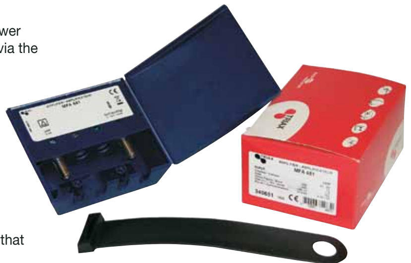
MFA 651 UHF amplifier Art No. 340651