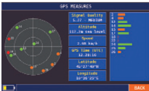
GPS signal reception measurements